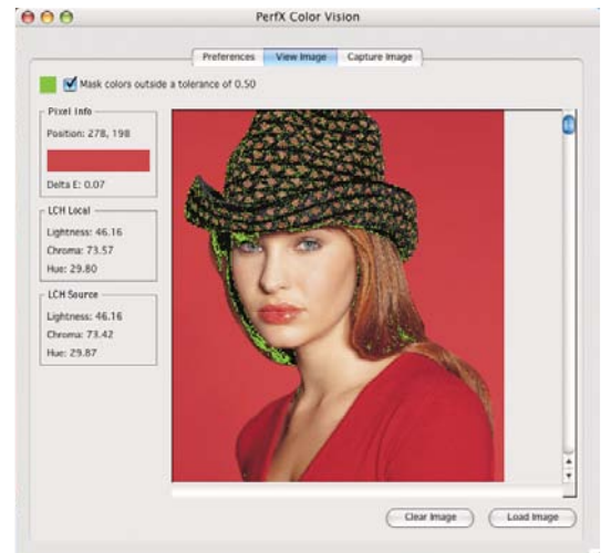
Interface for remote soft proofing