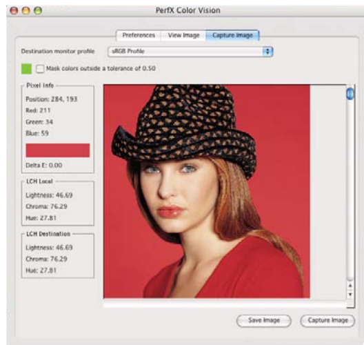
Interface for original image screen capture