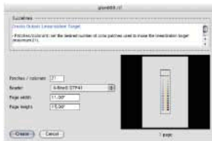
Creating the Linearization target