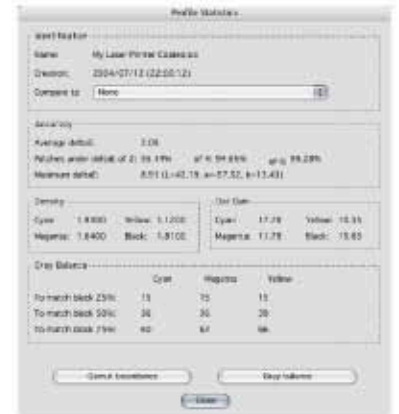
Output profile Statistics