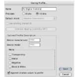
Saving the Input profile