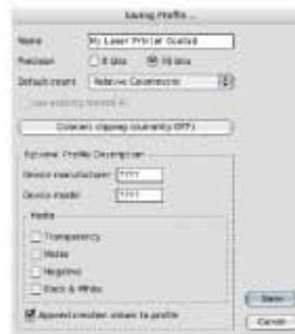
Saving the Output profile