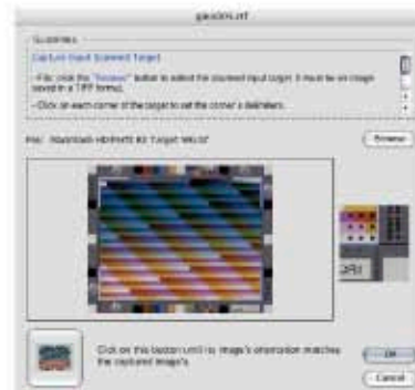
Capturing the input target (camera)