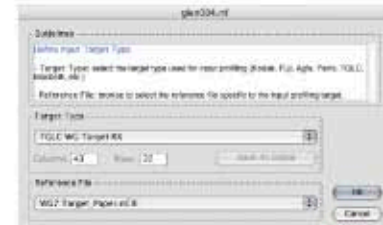
Choosing the Input target type