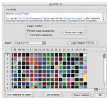
Measuring the Output target