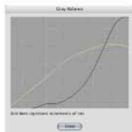
Gray Balance Curves