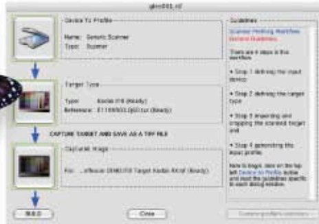
Main interface for Input profiling