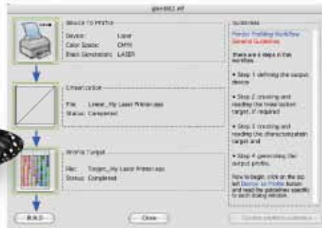
Main interface for Output profiling