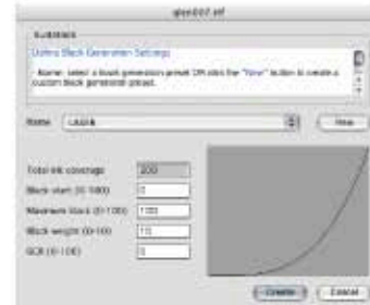
Presetting the Black Generation