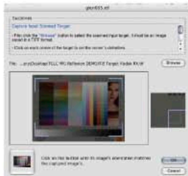
Capturing the input target (scanner)