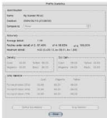
Input profile Statistics